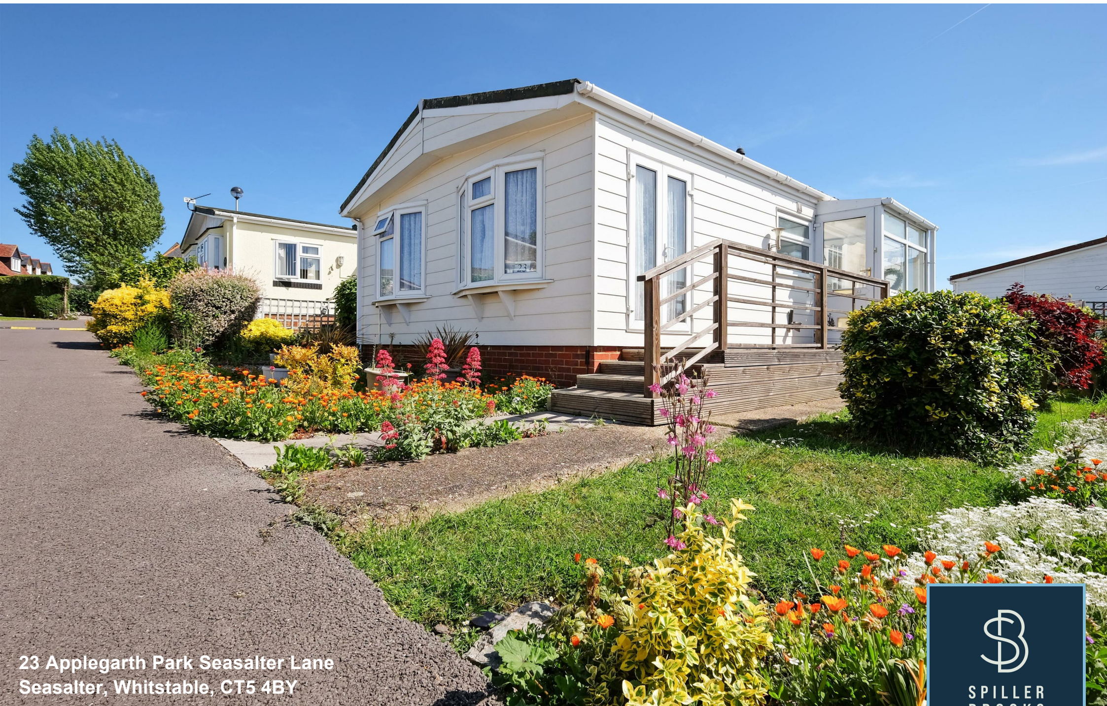
23 Applegarth Park Seasalter Lane Seasalter, Whitstable, CT5 4BY